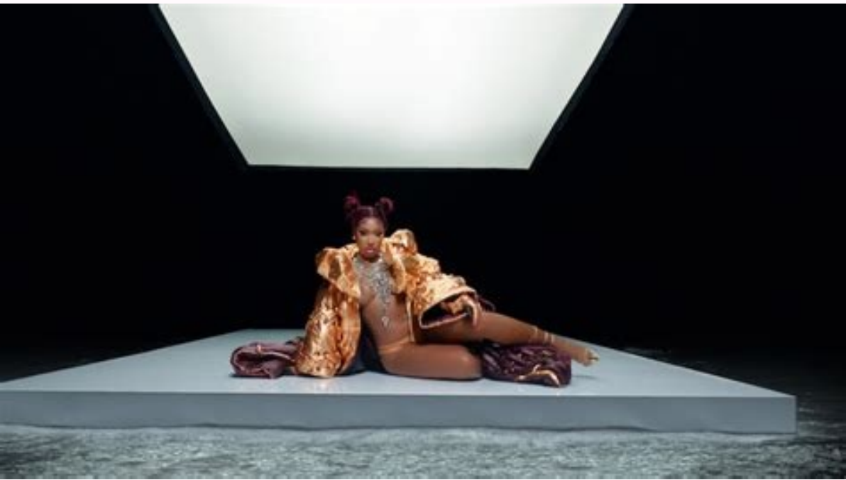
Coming to america music video.