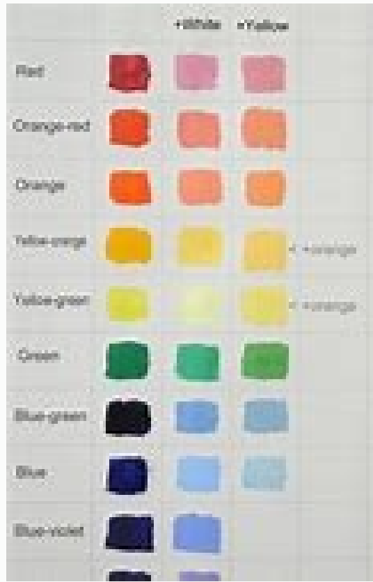
How to measure acrylic paint for mixing.